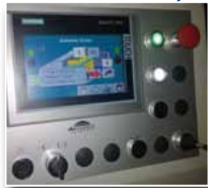
Main control panel With an integrated user-friendly touch screen.