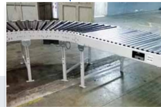
Bundle conveyors option To feed bundles to eLM.