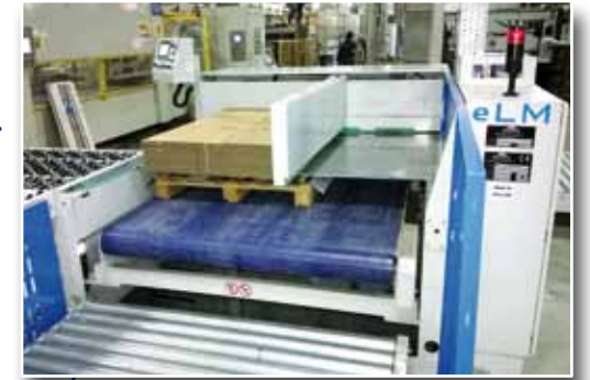
Lift equipped with plastic belt For stable transport.