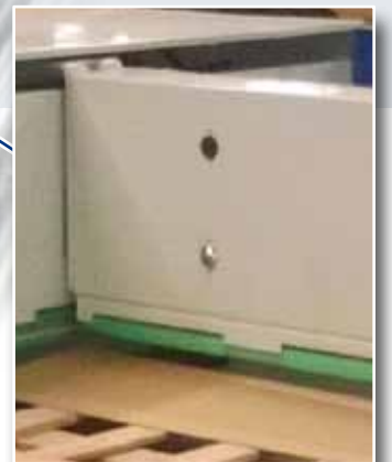
Auto stripper cycle ball For 1 and 2 up orders.