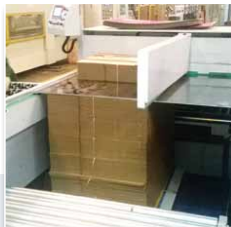
Load compression To generate a more stable stack.