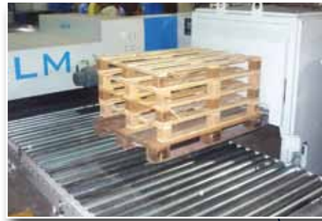
PalletHandler option To deliver pallets to the eLM.