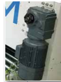
All electric And therefore smooth movements.