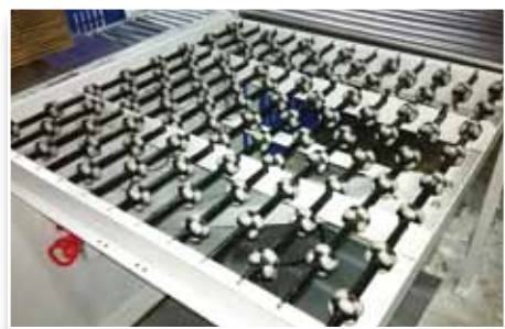
Ball table option (Stainless steel table is standard).