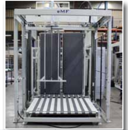
Infeed conveyor Transports stacks into the eMF.