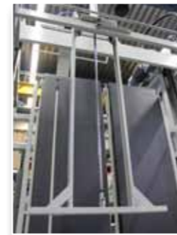
Tophold For stability of the stacks.