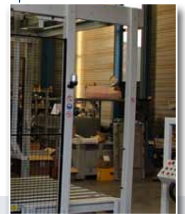
Easy access For tie sheet removal.