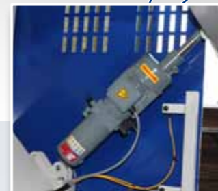
Lifting units For safe, strong and controlled lifting of the extendo.