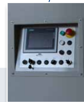
Main control panel With an integrated user-friendly touch screen.