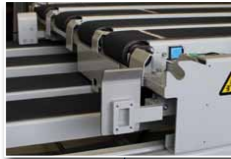
Pre-hopper tampers For good positioning in the pre-hopper.