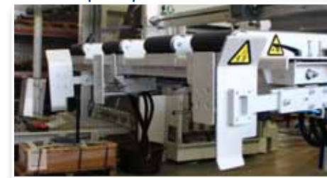
Tampers option Powered adjustable side tamper guide. Operating and drive side.