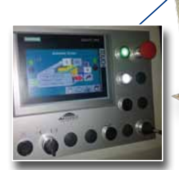
Main control panel With an integrated user-friendly touch screen.