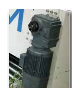
All electric And therefore smooth movements.