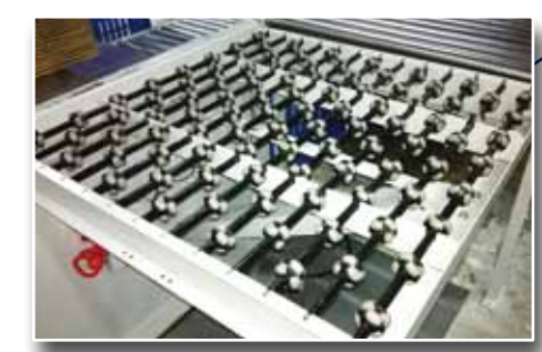
Ball table option (Stainless steel table is standard).