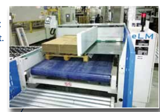
Lift equiped with plastic belt For stable transport.