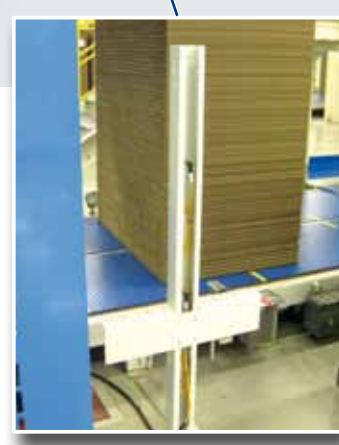
Entrance control For save working near the exit conveyor.