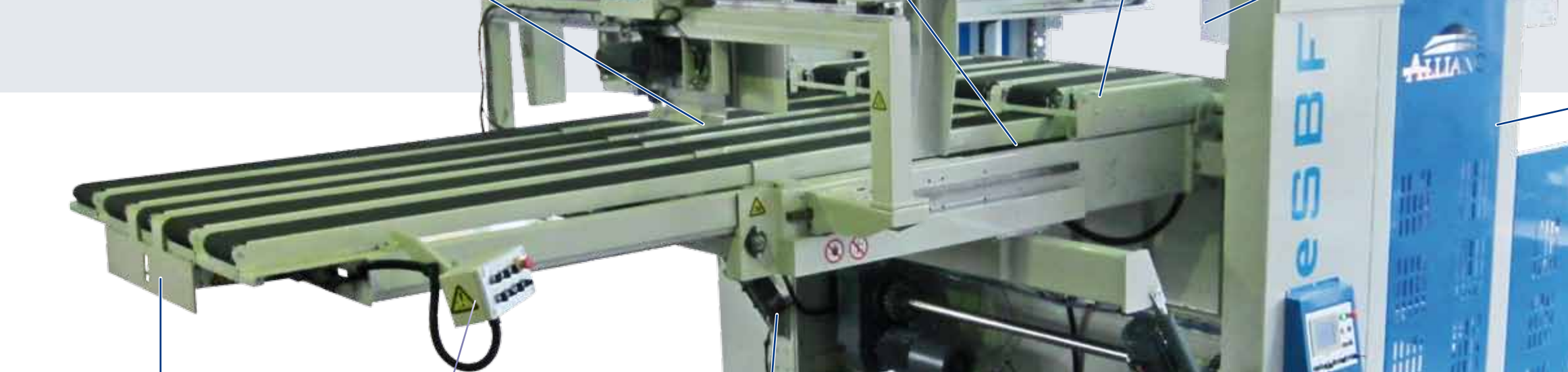
Extendo controls Extra control panel.