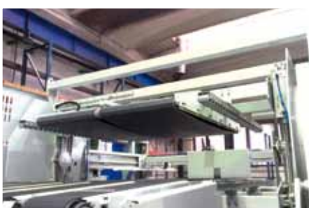
Option K Inverter. For rotating bundles. Including last sheet cart.