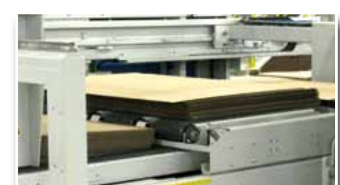
Option CS Continuous shingle. A second driven conveyor to provide a constant stream of shingled cardboard.